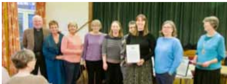
The Reydon Lights Committee

The Reydon Lights Committee: Christmas lights have been a constant feature every year since, we think 1978. It all began at Reydon Corner and since then the fundraising committee have been responsible for heart-warming and dazzling displays all over the village, not just at Reydon Corner, but at Jubilee Green where the huge village Christmas Tree stands, at The Village Hall, outside Boyden's, Barbrook's, and The Randolph and on the Halesworth Road at The Drive. Reydon's Christmas lights are envied by many local towns and villages. To give you an idea of how much money is raised, each year there's not much change from £10,000!