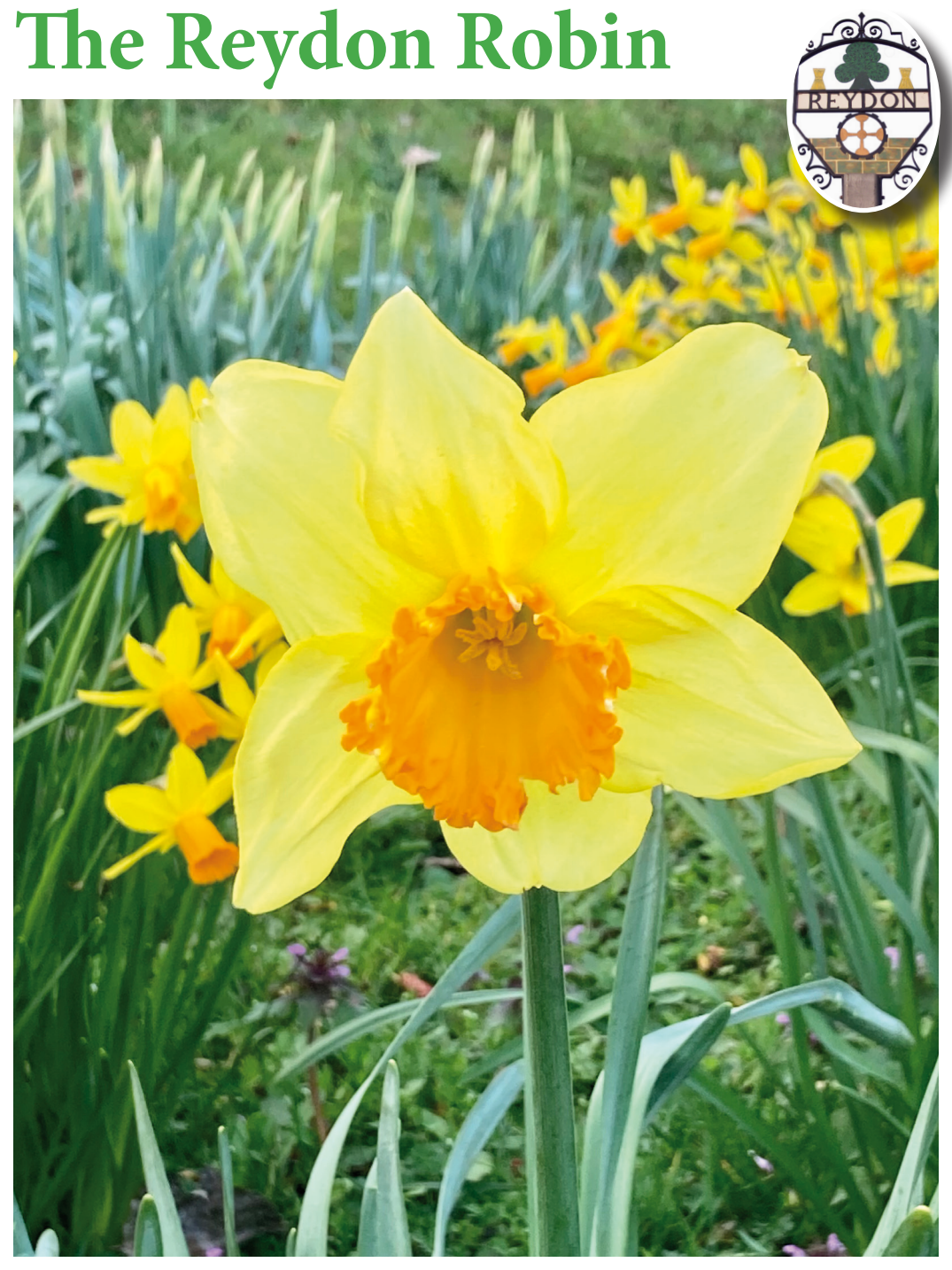
The quarterly, complimentary news magazine for Reydon Spring 2023 ISSUE 6