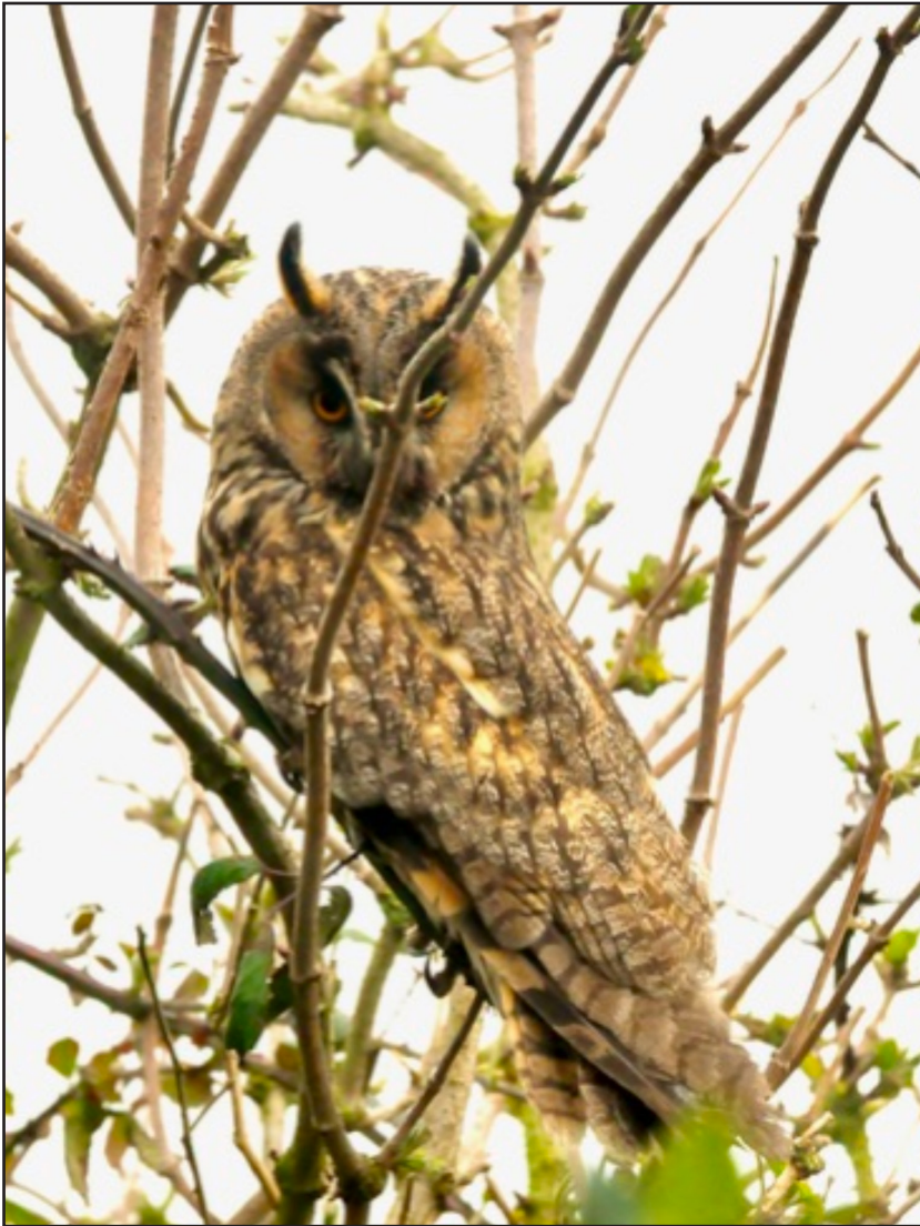
A Long-eared Owl (see page 7)