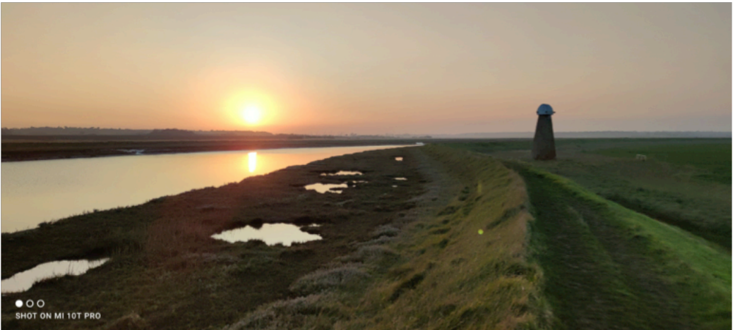
The River Blyth, with Reydon Quay in the distance

This has been well told in Rachel Lawrence's Southwold River (Suffolk Books 1990). Built around 1740 as an alternative to Blackshore for loading and unloading goods in the coastal trade, thereby avoiding harbour dues at Southwold, Miles Barne of The Sotterley Estate ensured it was a viable enterprise.