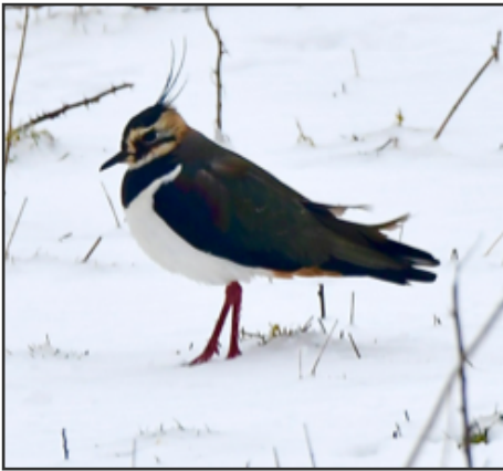
Here is a lonesome Lapwing, sporting icicles on its legs